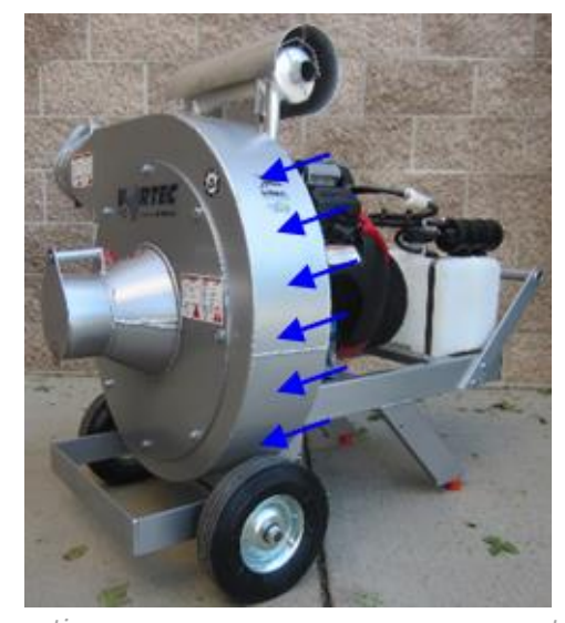
VORTEC Beast impeller